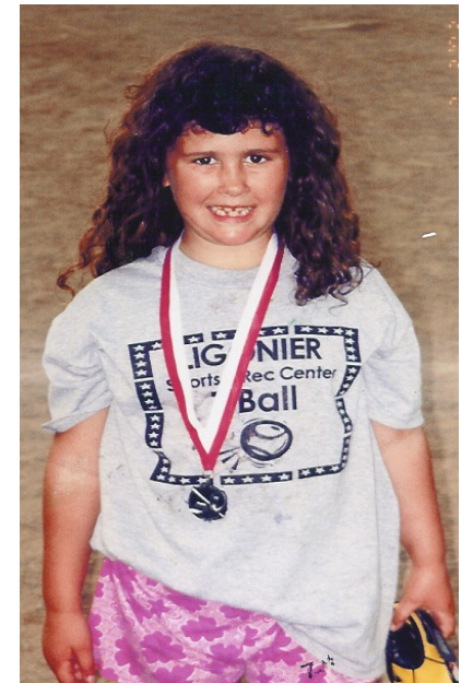
An endowment fund held at the